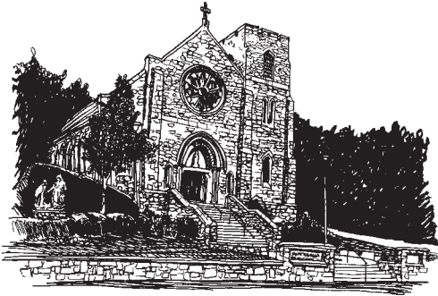
ST. THERESA Briarcliff Manor, NY