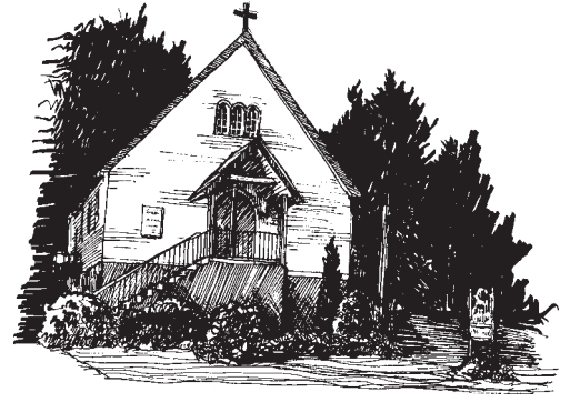
OUR LADY OF THE WAYSIDE Millwood, NY