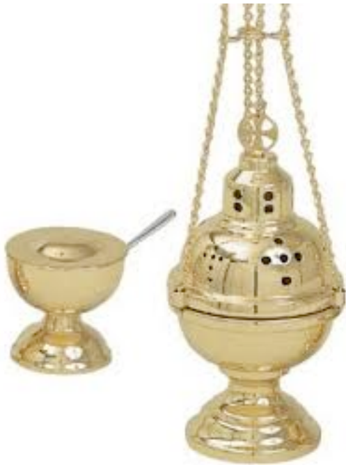
Boat and Thurible (Censer)