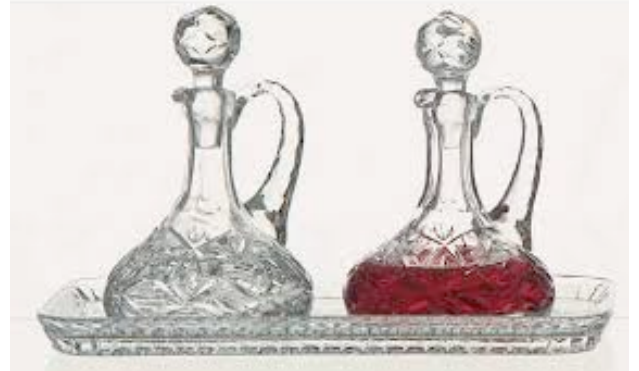
Cruets and Finger Bowl